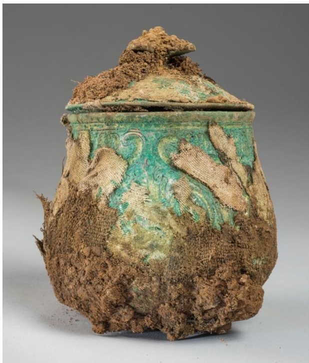
Figure 3 (lower right), lid off, first view inside the densely packed vessel containing a range of glass beads, pendants, brooches, curios and heirlooms, with traces of cord, wrapping, and bundling.