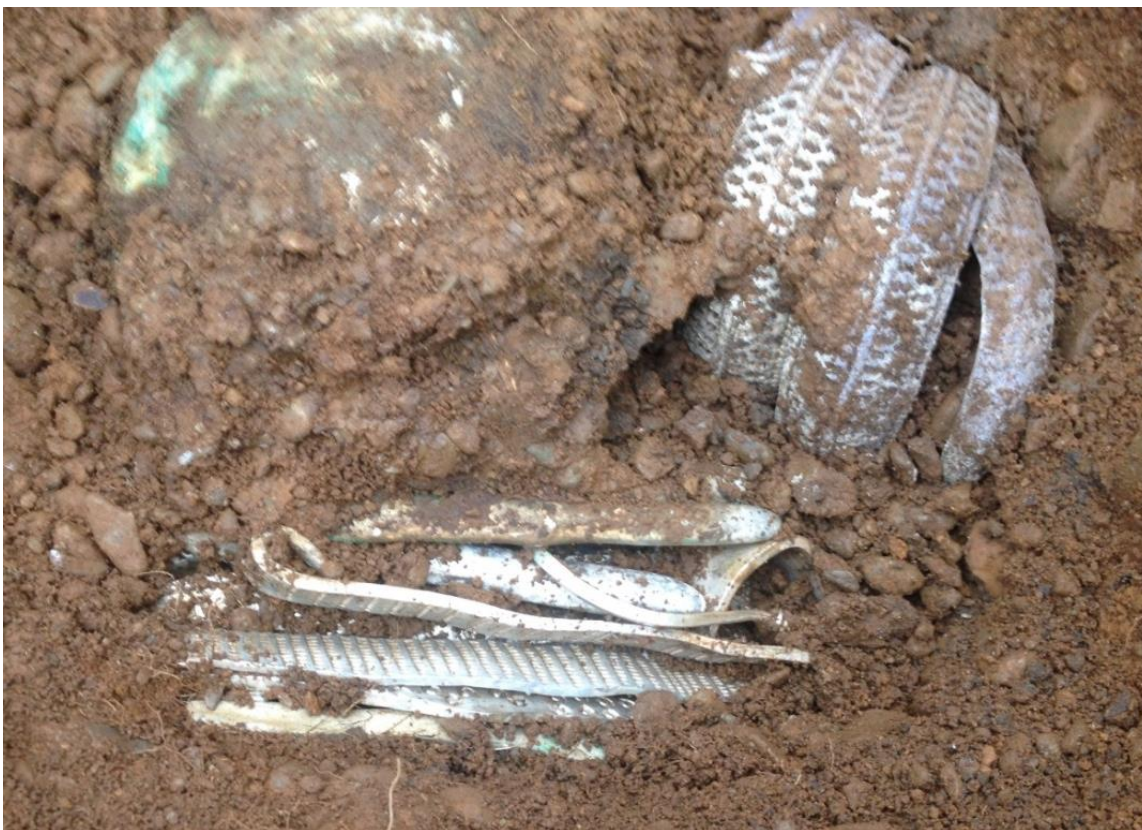
Figure 1 (above) Three distinct caches in the lower deposit of the hoard: leather-wrapped silver bullion (top lower); a silver arm-ring cluster containing a wooden box (top right); and a silver-gilt lidded vessel (top left).