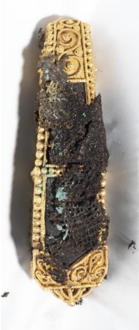
Figure 6 (below) A large gold-mounted 'black-stone' pendent with wrapping

Figure 5 (bottom right) Rock crystal jar wrapped with silk-lined leather pouch.